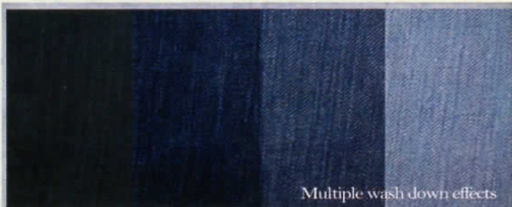
Multiple wash down effects

State-of-the-art Dyeing and Weaving technologies work together to ensure the quality of denim production keeping at par with international Standards while catering to a varied global denim market.